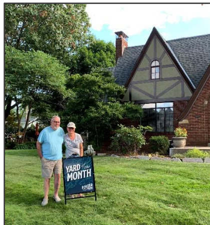
Pictured above | 1210 W. Lexington (left) and 1311 W. Foster (right)